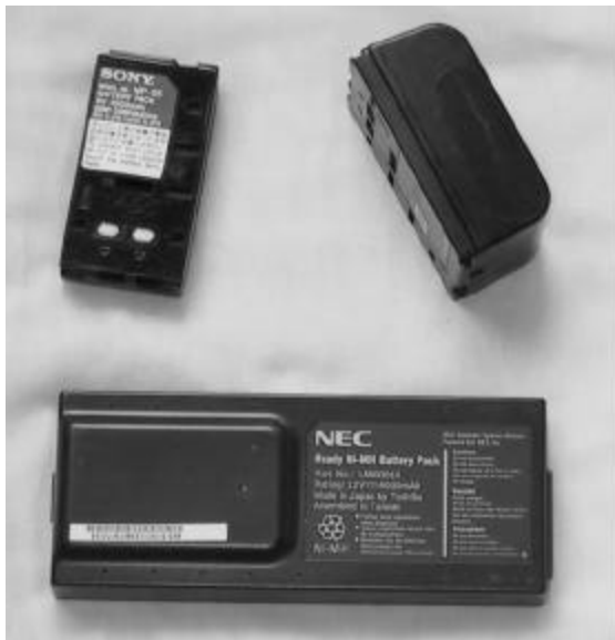
Nickel cadmium and nickel metal hydride batteries in custom shapes