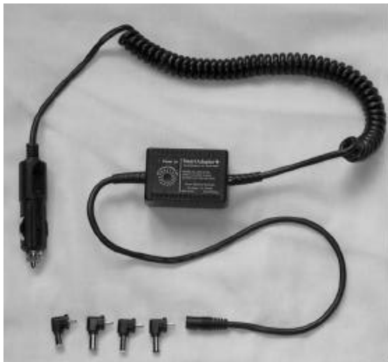
Versatile car adapter with adjustable voltage output for 6 to 21 volts and interchangeable tips (Nesco Battery Systems)

AAA, AA, and 9-volt batteries. Flashlights and desktop radios typically use the larger C or D-size cells and really use the power, so you may want to have even more of these larger sizes at the ready.