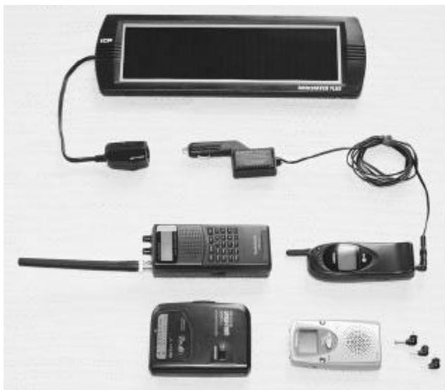
Inexpensive 2-watt solar module and 12-volt car adapter will recharge most small electronic devices.

dard physical size and voltage for all vehicles, you do not need a separate charger for each device and vehicle. Do not purchase a solar module smaller than 2-watt output, as it will take longer than a single afternoon to recharge all but the smallest battery sizes. For large laptop computer batteries, I recommend a 10-watt solar module, which will provide approximately 1 amp of charge current. Remember